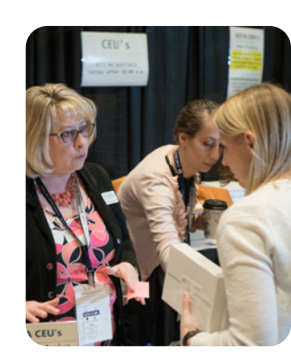
MISSOURI ASSISTIVE TECHNOLOGY | 2019 ANNUAL REPORT